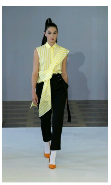
SHOES · 40 EU B/W/H · 82/63/94